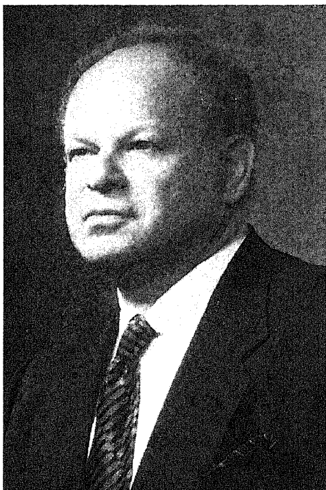
Martin E. P. Seligman